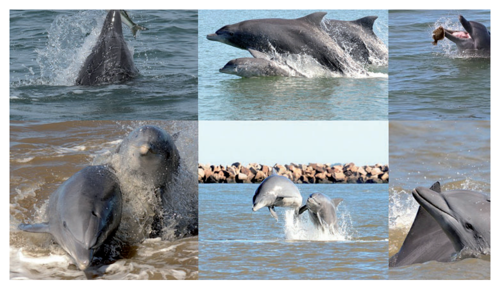
Fig. 3: Lahille's bottlenose dolphins, Tursiops gephyreus , socializing, feeding and travelling in the Patos Lagoon estuary and its adjacent coastal waters, in Southern Brazil.